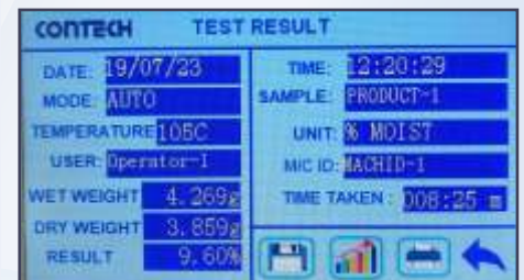
DISPLAY OF TEST RESULTS