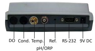
Ports for different electrodes on the rear panel